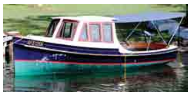
Figure six - Lake Mac launch after restoration.

For more information on repairing rot refer to the article titled 'Modern Technology Rot Repair' in AABB #94. Plus, there is a full series of photos on the project at www.BoatCaftNSW.com under customers projects. The completed restoration is a credit to the owner, as he has done a magnificent job.