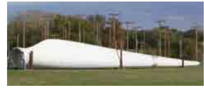
Figure 10 – Large wind turbine blade.

The advantages of epoxy composites in modern manufacturing applications are growing at a rapid rate. This is a major reason why carbon fibre and other exotic composite fabrics are at a premium price.