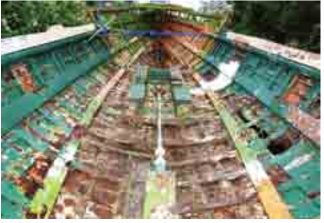
Figure four - Lake Mac launch before restoration.

Case Study four - To include a poor wooden boat restoration; a customer at Lake Macquarie restored a classic carvel hull Lake Mac fishing launch. Before he started, he asked me to have a look, as I was in the neighbourhood. The hull had been sheathed with polyester and chopped strand matt which looked very ordinary. Plus, there was quick drying cement in the bilge over a plank weeping seawater. I envisaged rotten timber between the polyester and planks. Fortunately, the damaged area must have been from hitting something and the salt water seeping in and filling the bilge had actually preserved the planking. In most cases, once sheathed with polyester resin the water lying inside is fresh water. In these situations, you might as well buy a chainsaw, as the hull is guaranteed to have rotten planks within a few years.