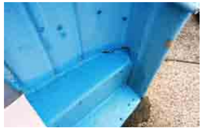
Figure three - Dinghy seat delamination.

Case Study Three – Another classic example of polyester being a poor adhesive occurred one Sunday morning whilst transporting our demo FRP dinghy on my car roof racks. A piece of FRP broke out of