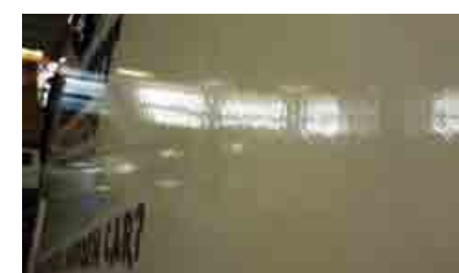
Figure nine – Vinylester print through on a new van.

Case Study Three – I was recently at a caravan show in Sydney and escaped from our stand to have a look at caravans. I was wondering through and saw the classic vinylester fabric print through. I interrogated the sales rep and sure enough they are using a vinylester skin each side of a foam core. It will be interesting to see how these caravans stand up to going bush on rough Aussie roads with tree branches whacking into the sides. It will be interesting to see how they hold up over time. See the print through at figure nine .