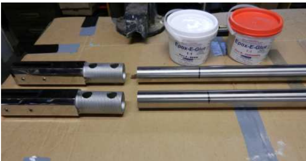
Stainless Steel Glass Brackets & Stainless Steel Post that Epox-E-Glue applied & Slid were a sloppy good Fit

Get around finding someone to weld Stainless Steel with the chance of damaging the highly polished surface by Gluing up with EPOX-E-Glue