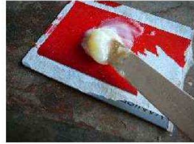
Mix the two parts.