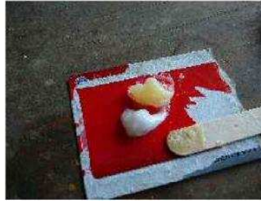
Equal parts by volume, by eye.