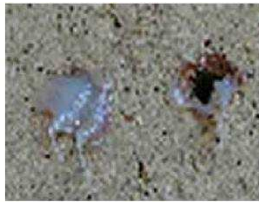
Put glue in the drilled holes