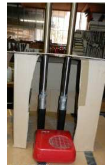
Accelerating Epox-E-Glue Cure time by warming the metal

Proudly Distributed by: DRIVE Marine Services