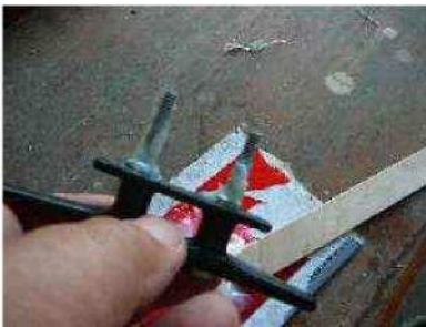
Apply glue to the screw threads