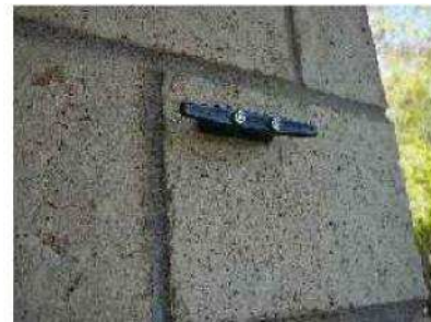
Push the screws into the holes and leave to set.

Get around finding someone to weld Stainless Steel with the chance of damaging the highly polished surface by Gluing up with EPOX-E-Glue