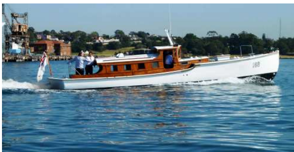
Figure 3 – MB 168 during post refit trials